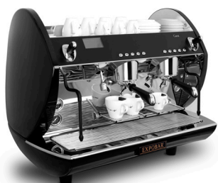
Carat Eco Display 2GR black