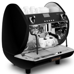
Carat Eco Mini Display IGR black