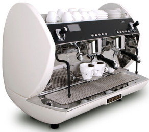
Carat Eco Display 2GR white