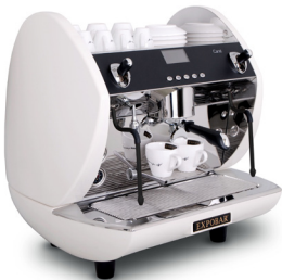
Carat Eco Mini Display IGR white