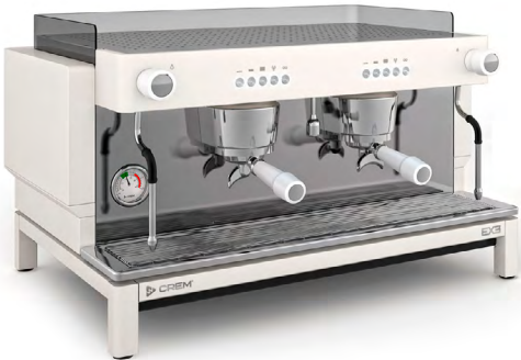
EX3 2GR CONTROL