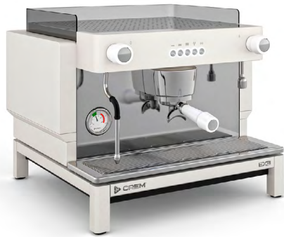
EX3 MINI 1GR CONTROL