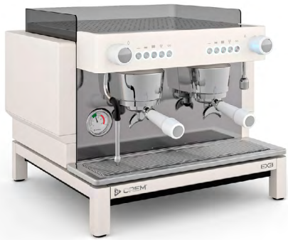
EX3 MINI 2GR CONTROL