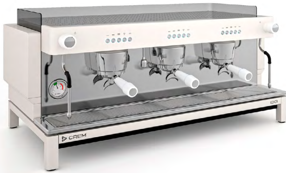
EX3 3GR CONTROL