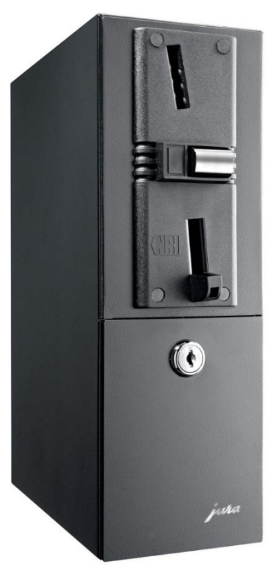
*Interface for transmitter